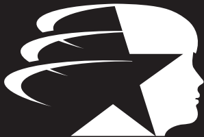
TEACHER OF THE YEAR 2010